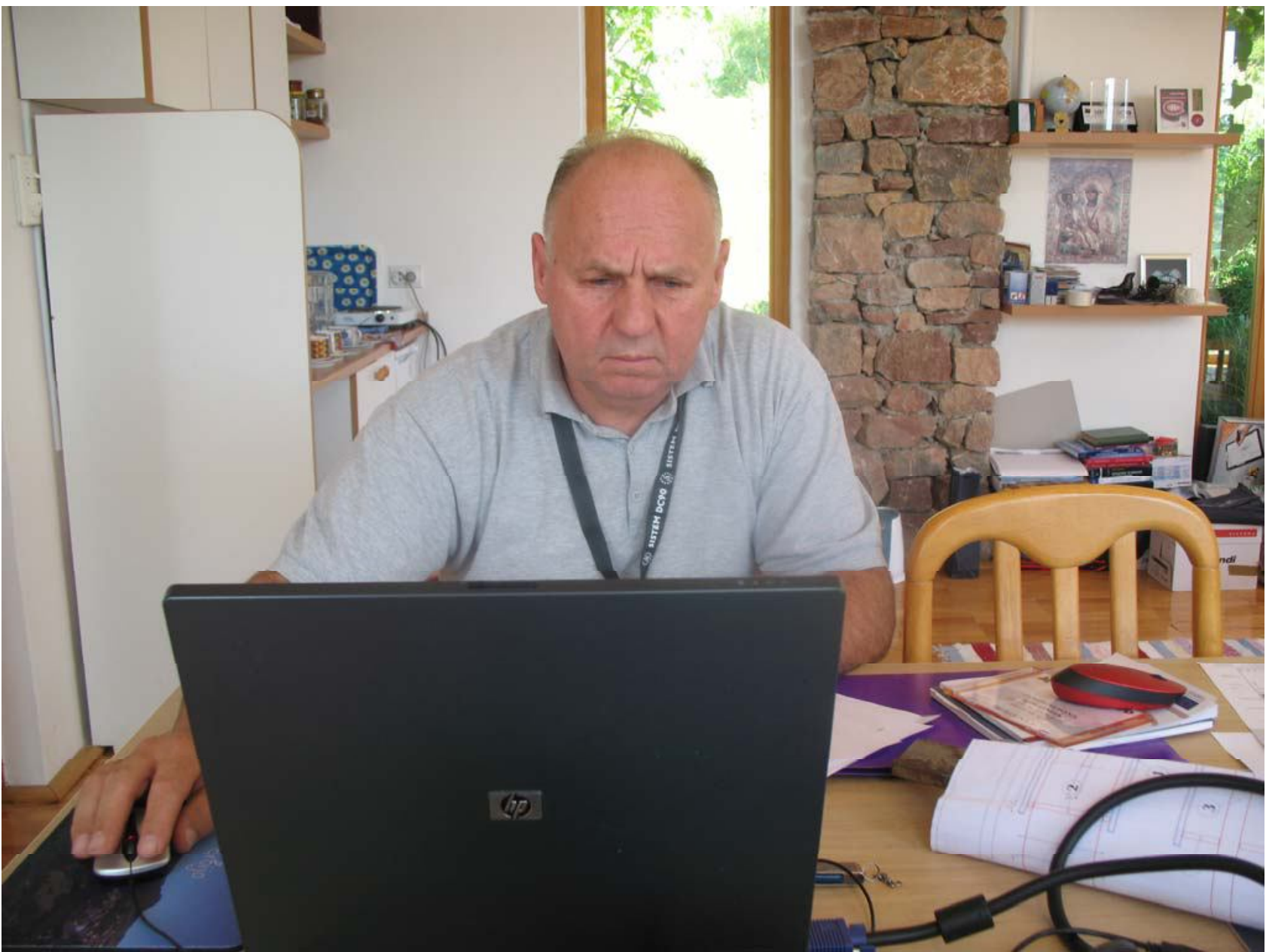
Jancic N. before the exposure of new construction of Dampers with quartz sand and floating cities.