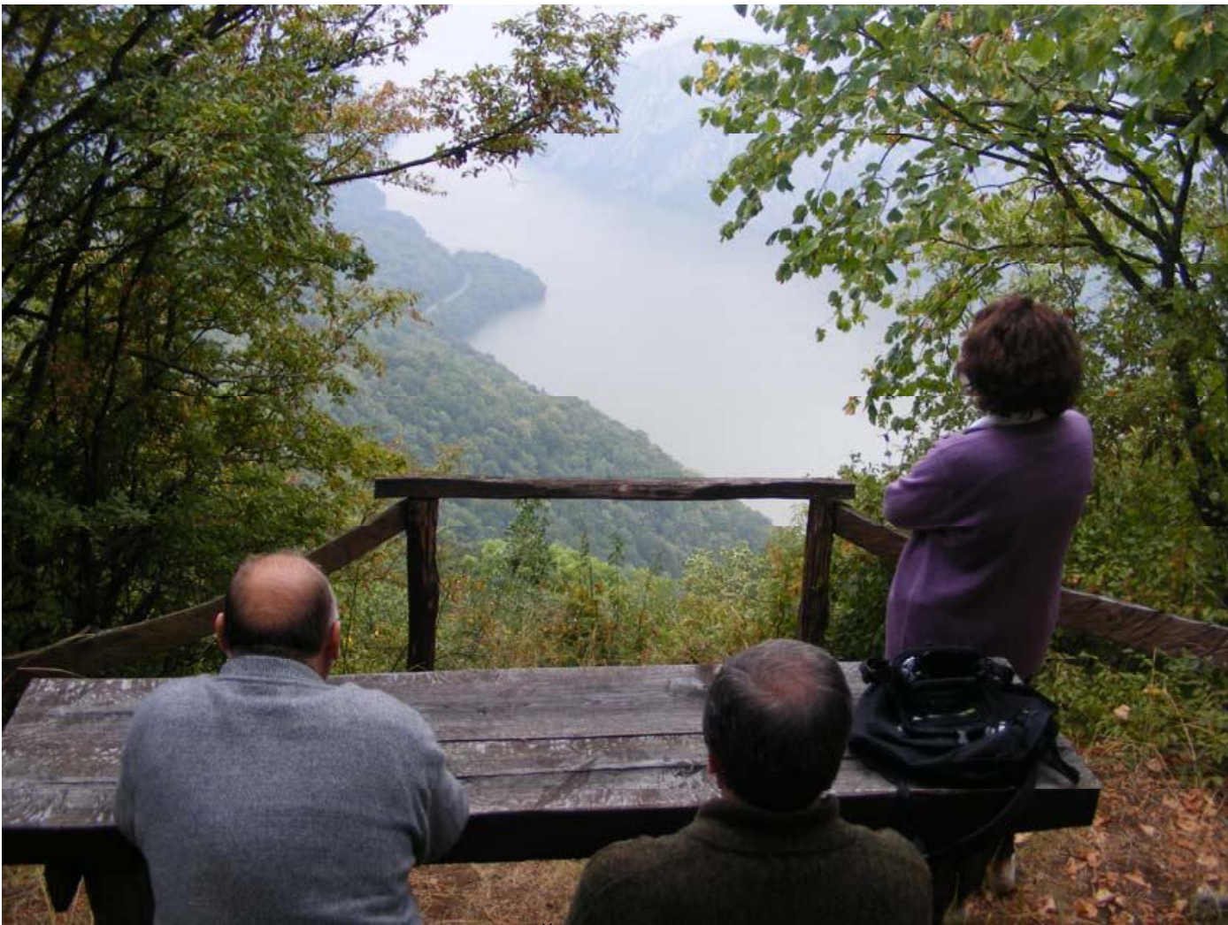
Viewpoint Ploce on veliki i mali kazan, Štrbac.