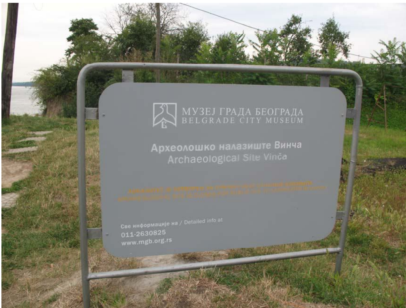
At the site of a Neolithic village Vinca.