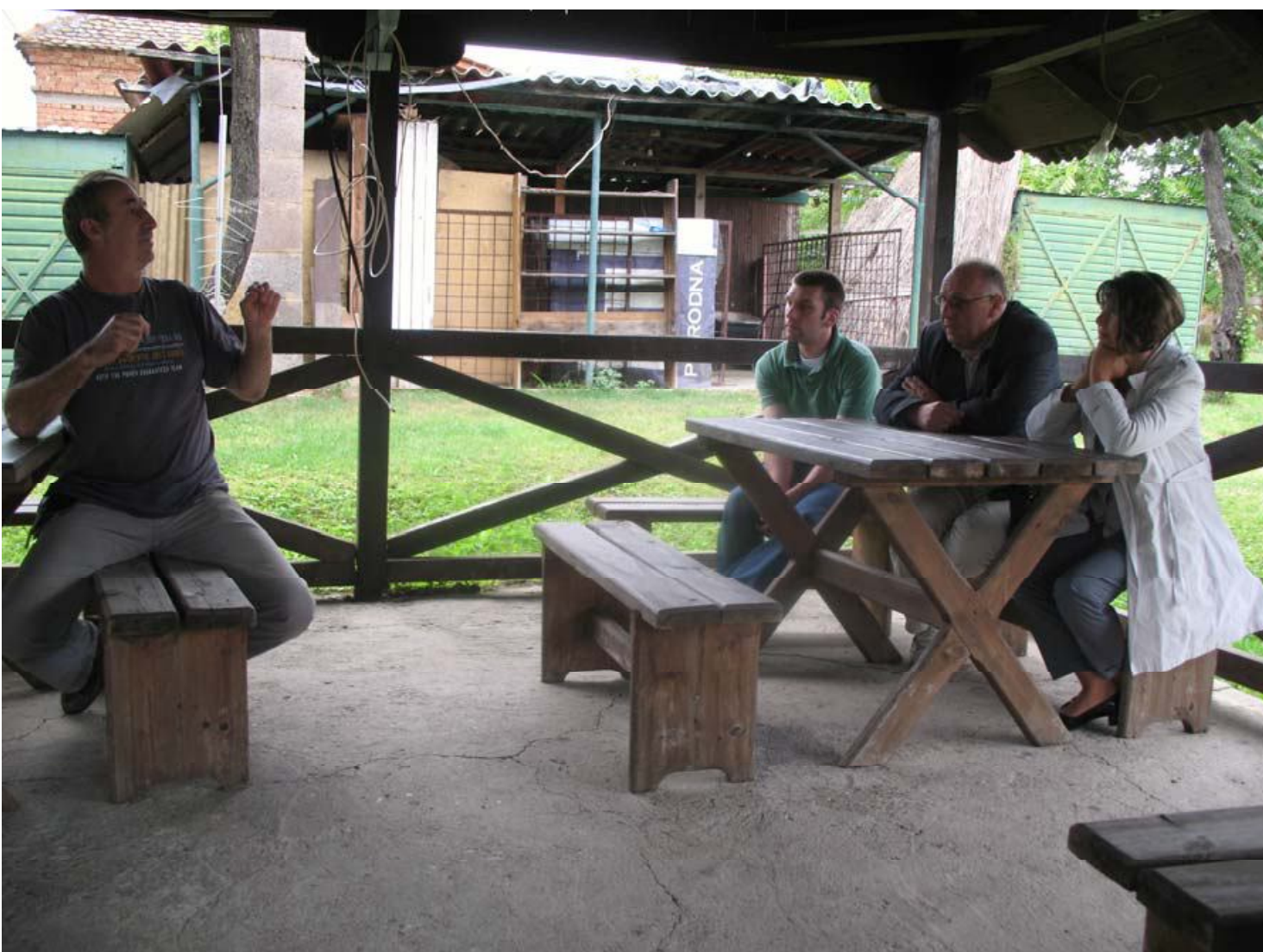
Curator at the site of Vinca. One of the first prehistoric towns based on trade and stationar agronomy.