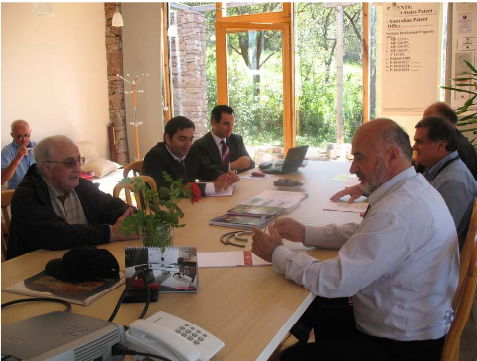
The new construction crescent dumpers intended for large displacements, especially in bridge construction.