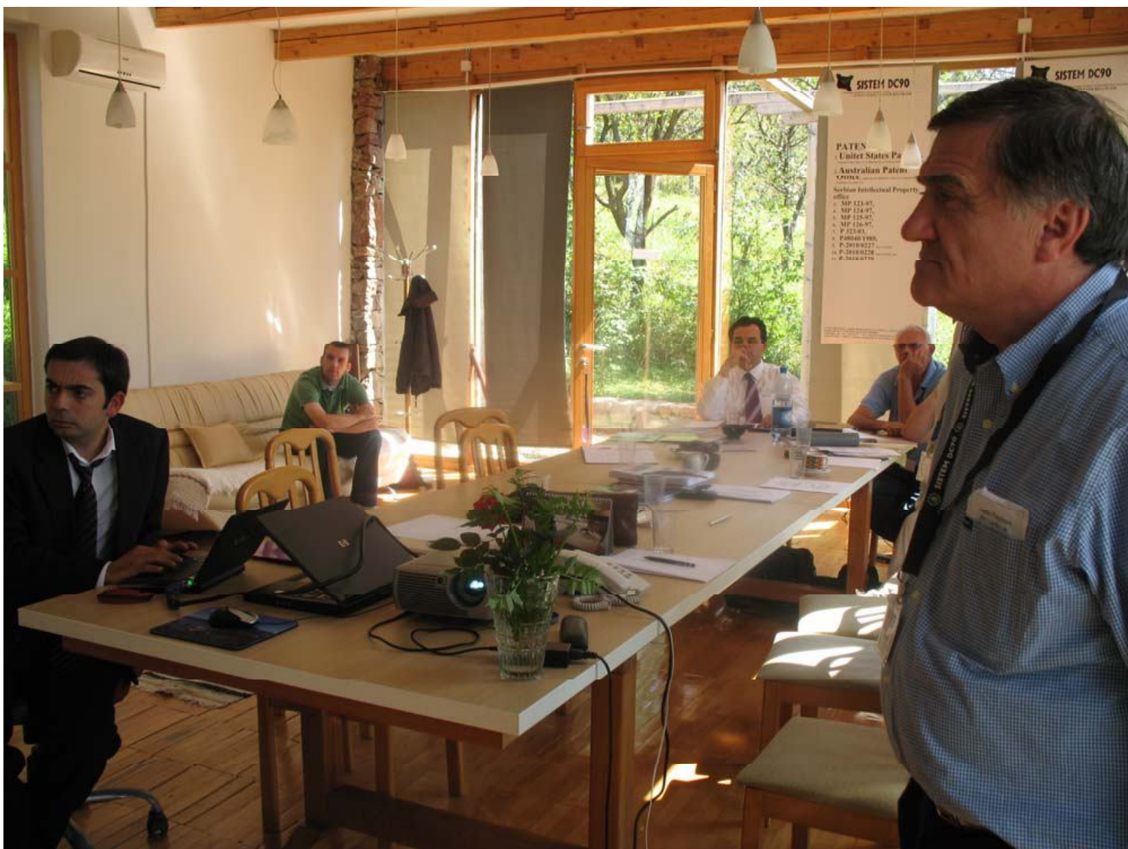
On-line display facilities oscillations in the U.S.A. via the Internet.