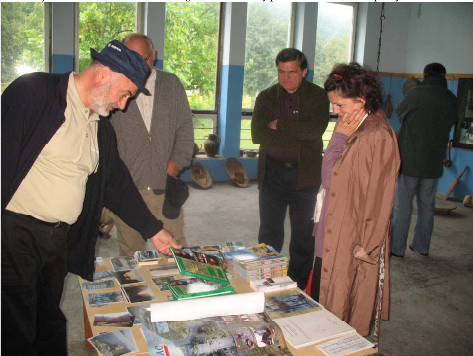
Ethnographic setting in Dobra.