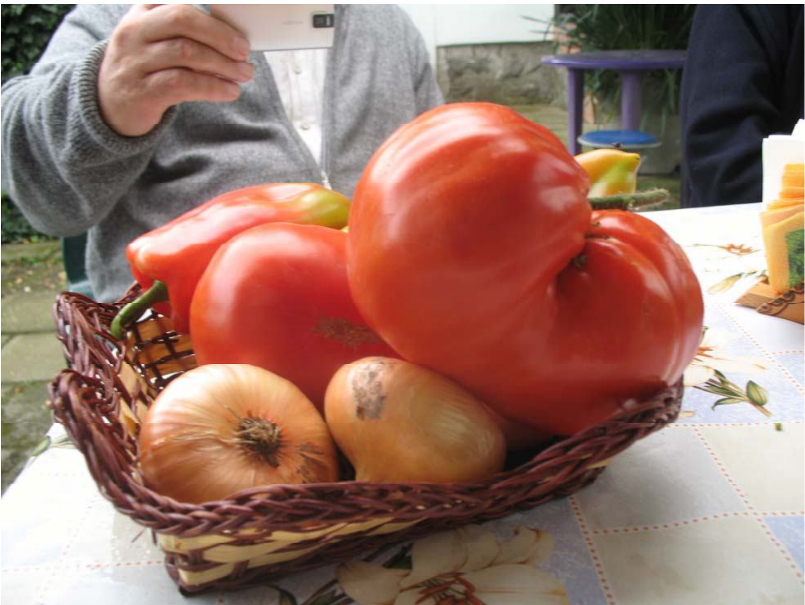
Organic vegetables from Dobra was constantly available and present on the menu.