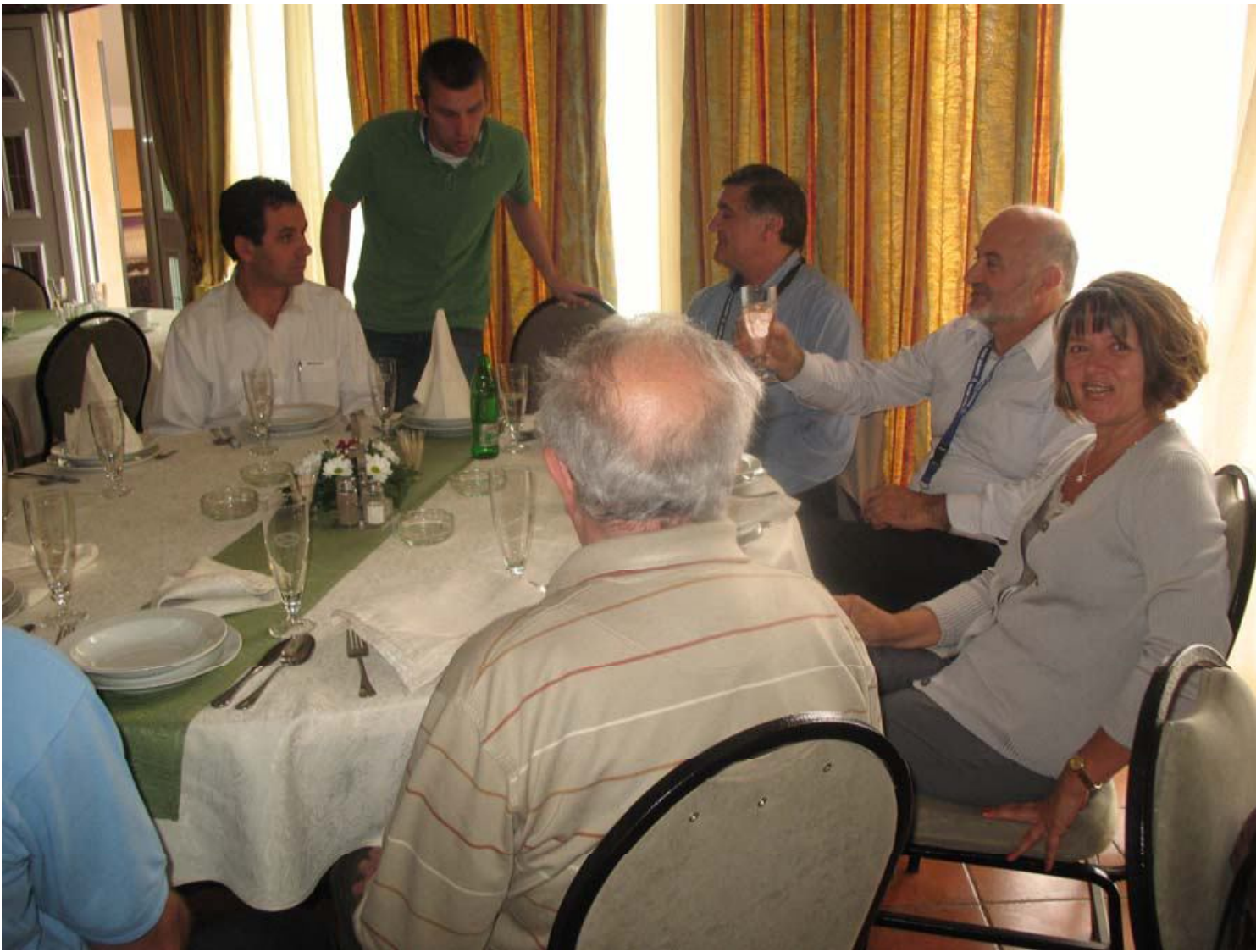
From joint lunch in Bolec