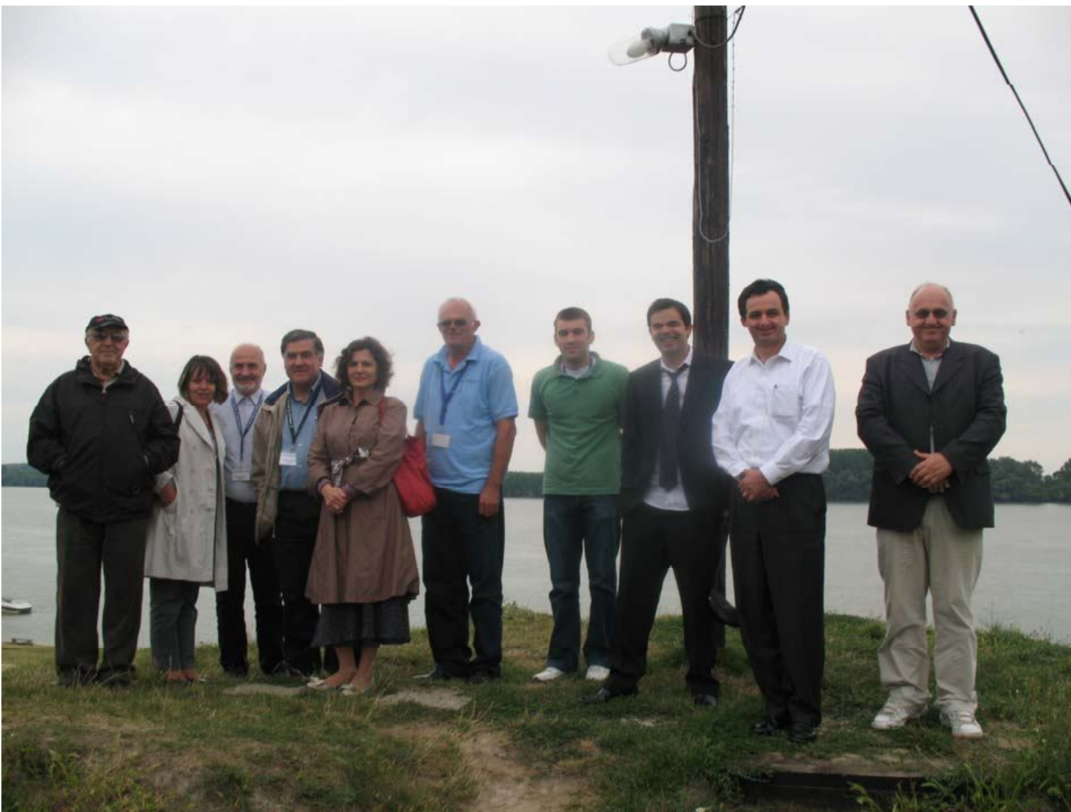
Joint clip on the slope of the Neolithic sites Vinca.