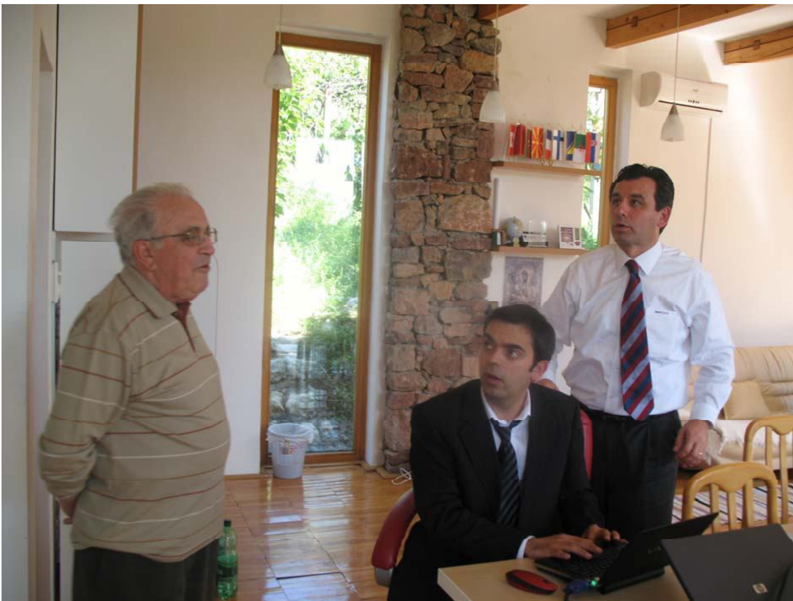
Digitexx represents the top technology for auscultation of objects in real time.