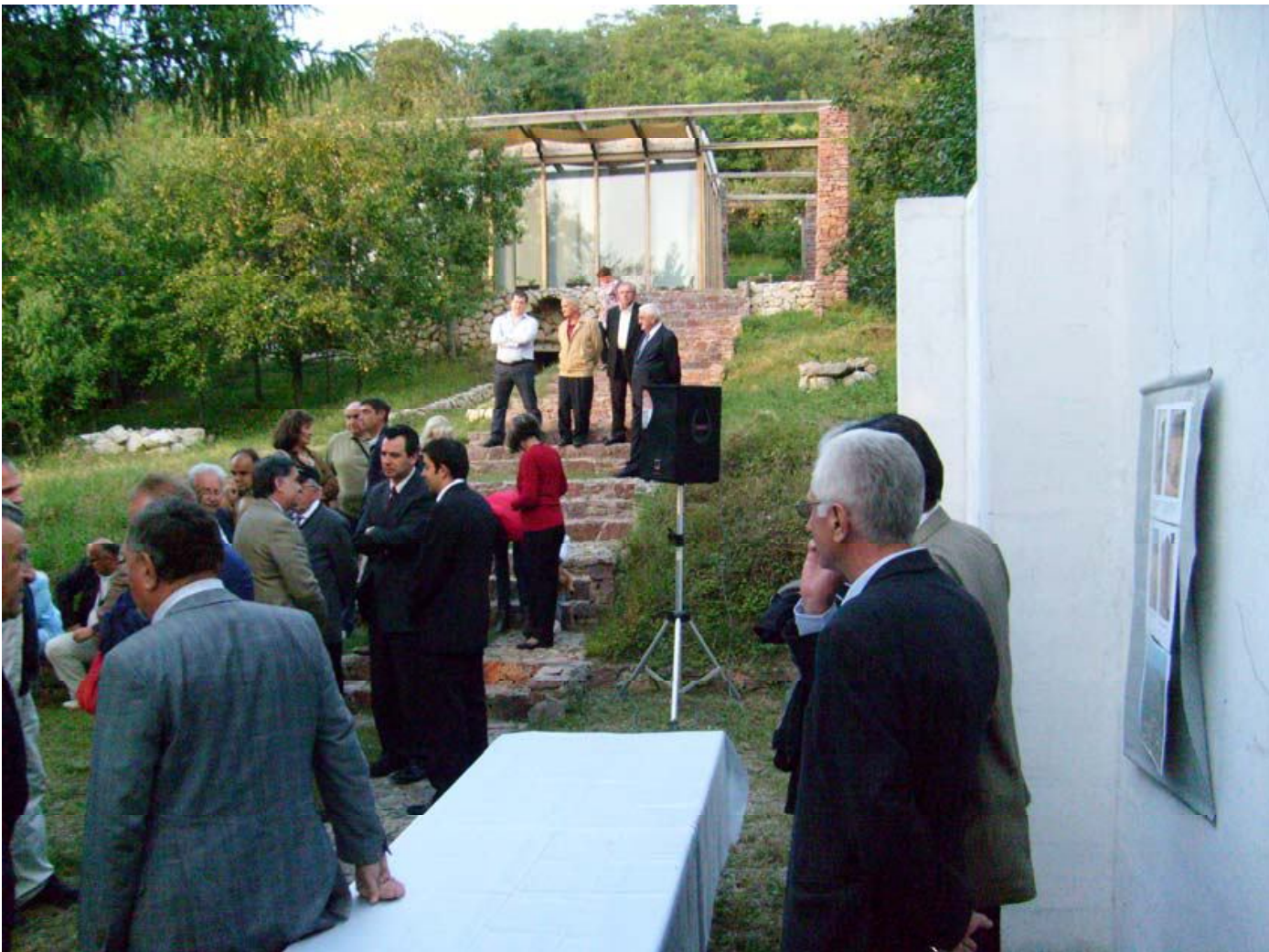
Shortly before the opening II Innovation colony in Bolec.