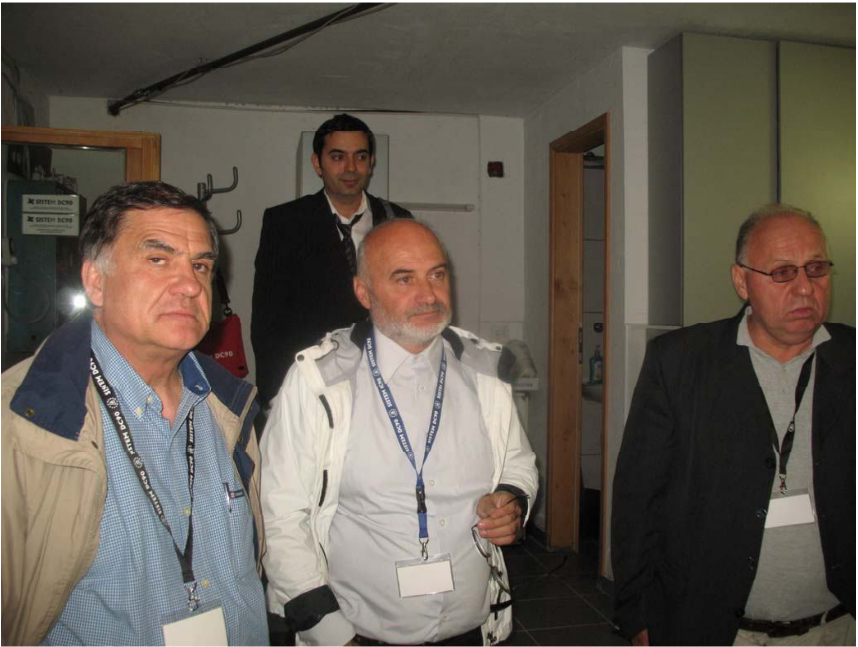
Anticipation in the process of testing new damper designs for adjusting the mass.