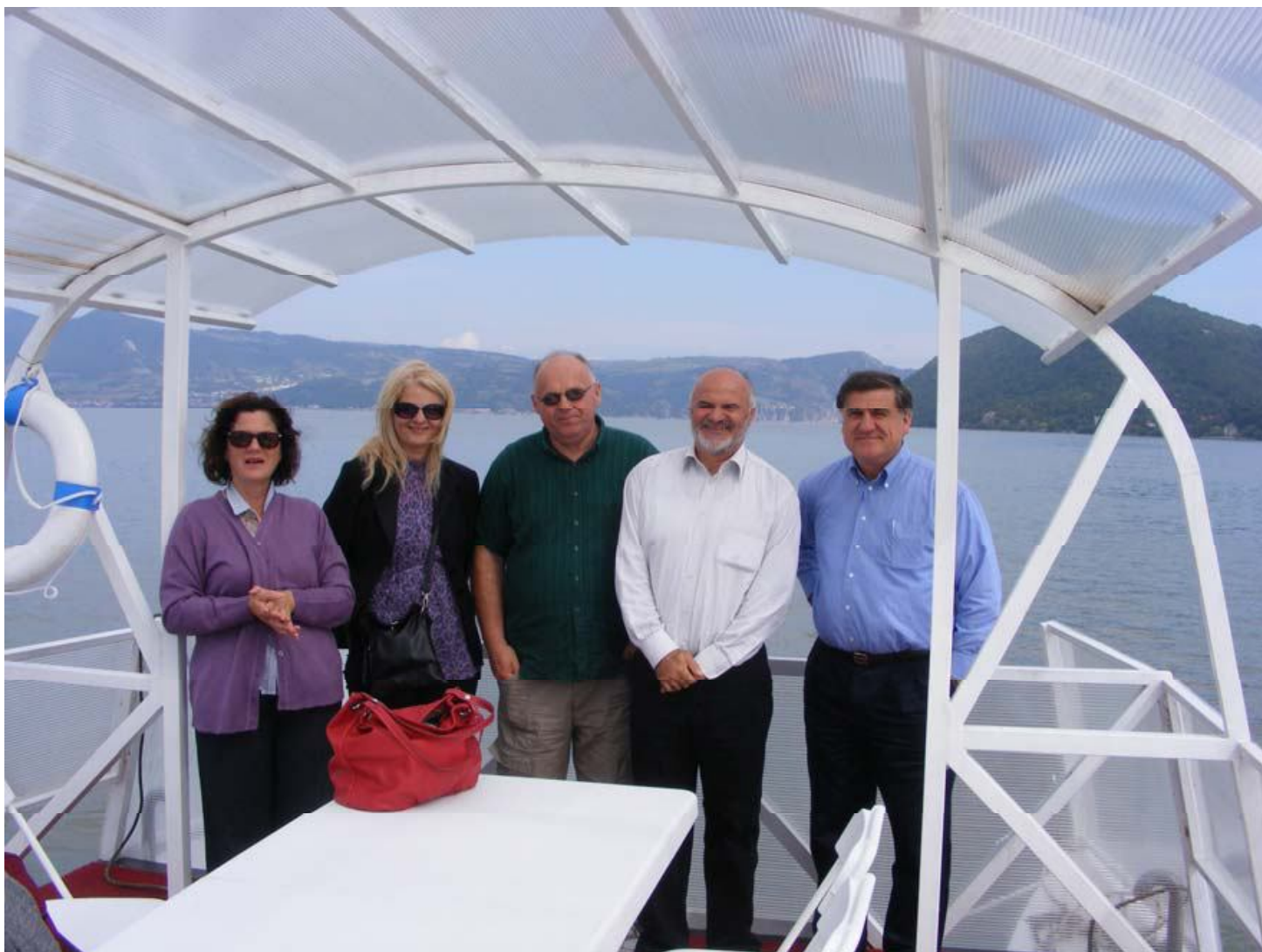
On the catamaran TO Golubac in Medieval Fortress.