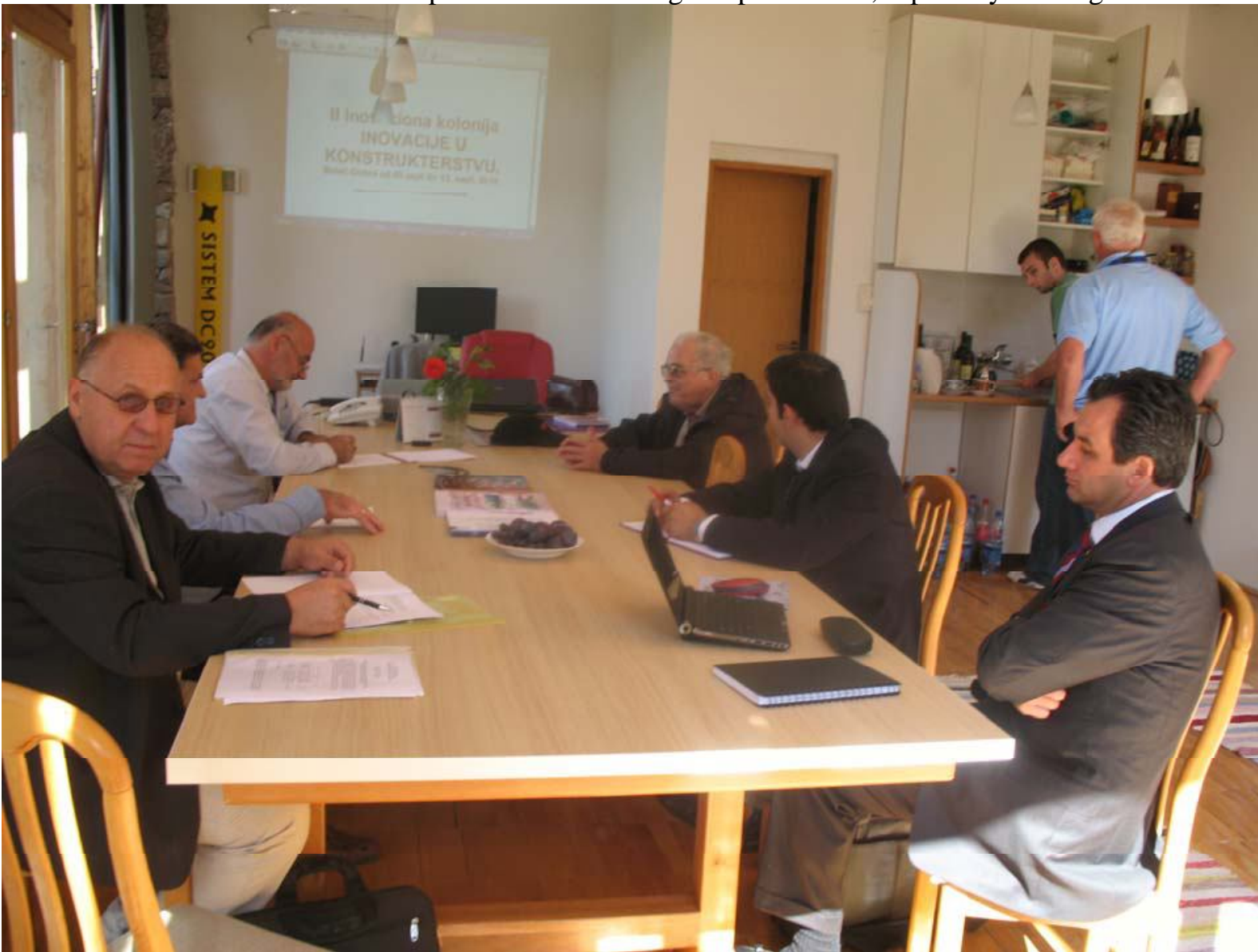
Before beginning of the presentation of basic communications.