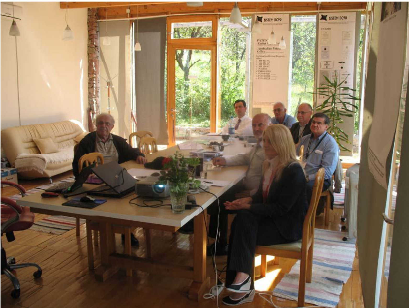
Careful monitoring of communications