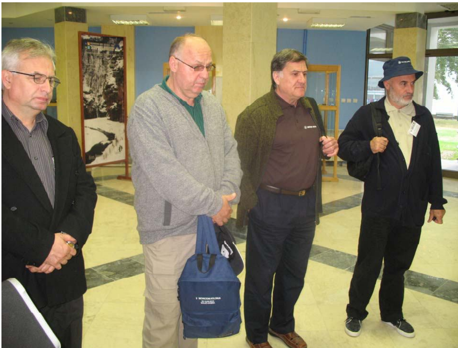
At museum in National Park Djerdap in D. Milanovac