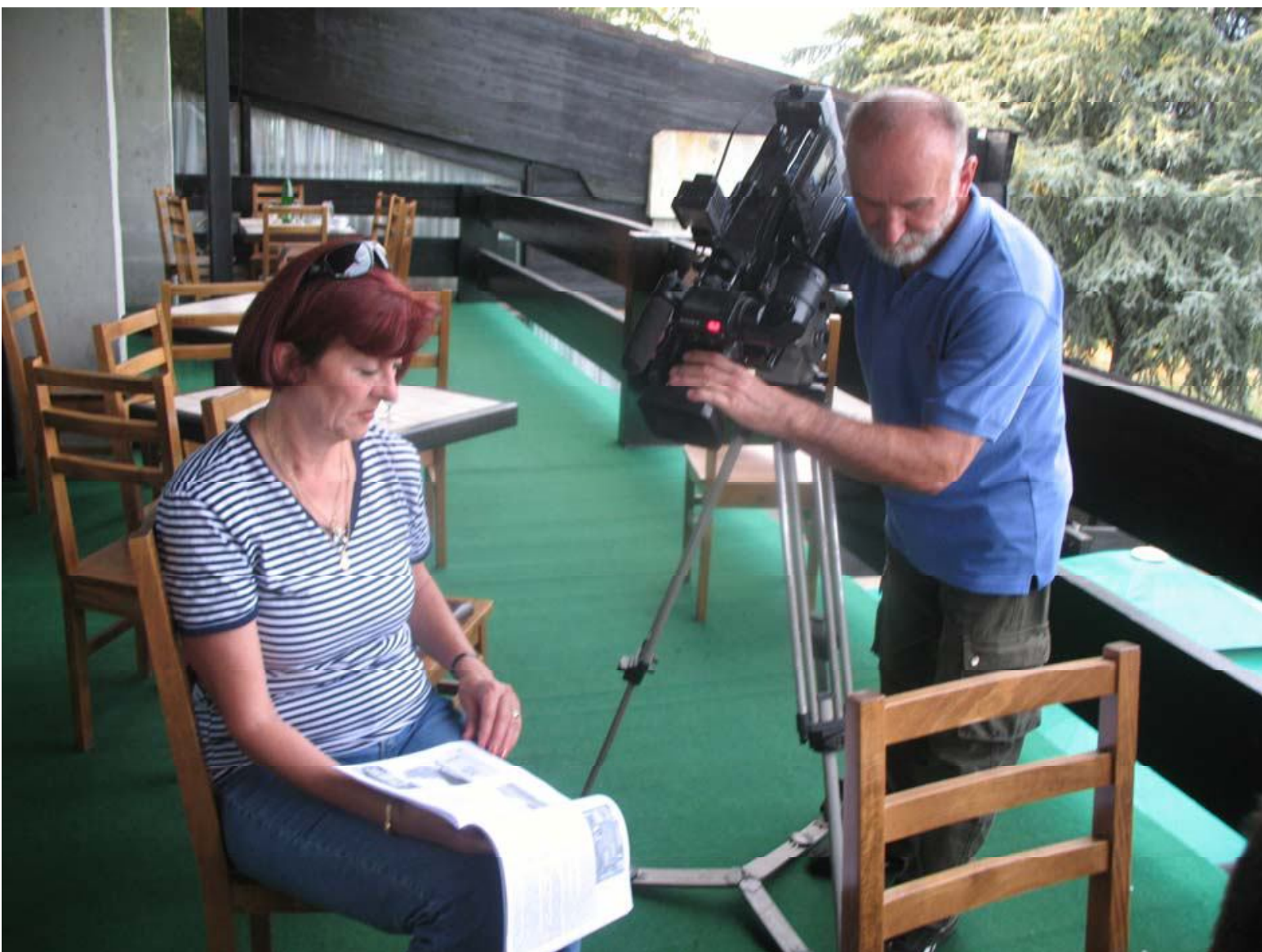
Team RTS TV Vojvodina was carefully monitoring and recording events.