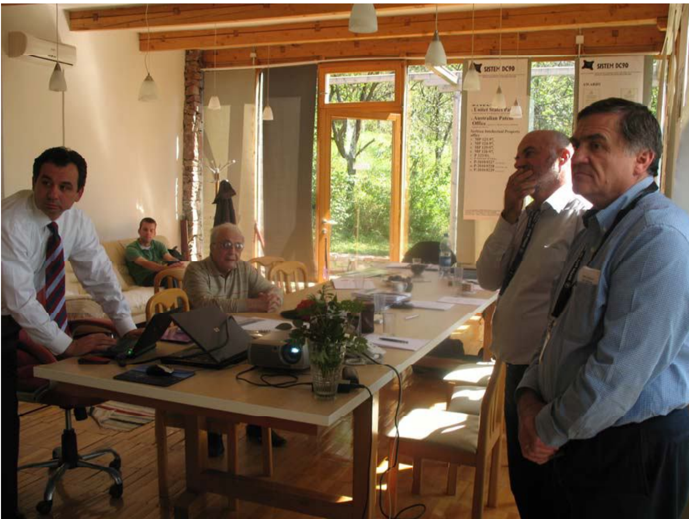
Very interesting on-line presentation of Digitexx monitorig system from facilities in the U.S.A.