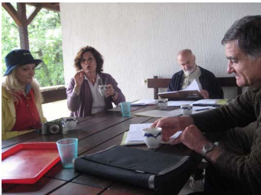
At viwpoint Štrbac-Kazani.