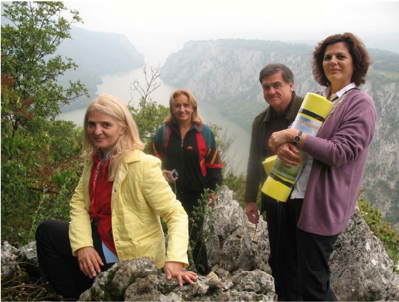
Unreal view from the viewpoint Ploce-Kazan. Europe's most beautiful gorge.