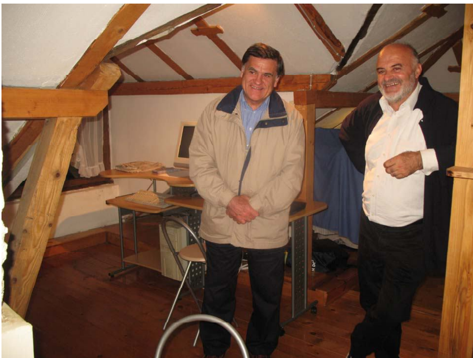
Innovation Center the Dobra, in the attic of family house.