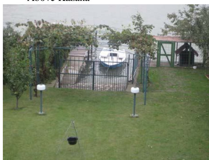
Small ports Cvetkovica u Dobri