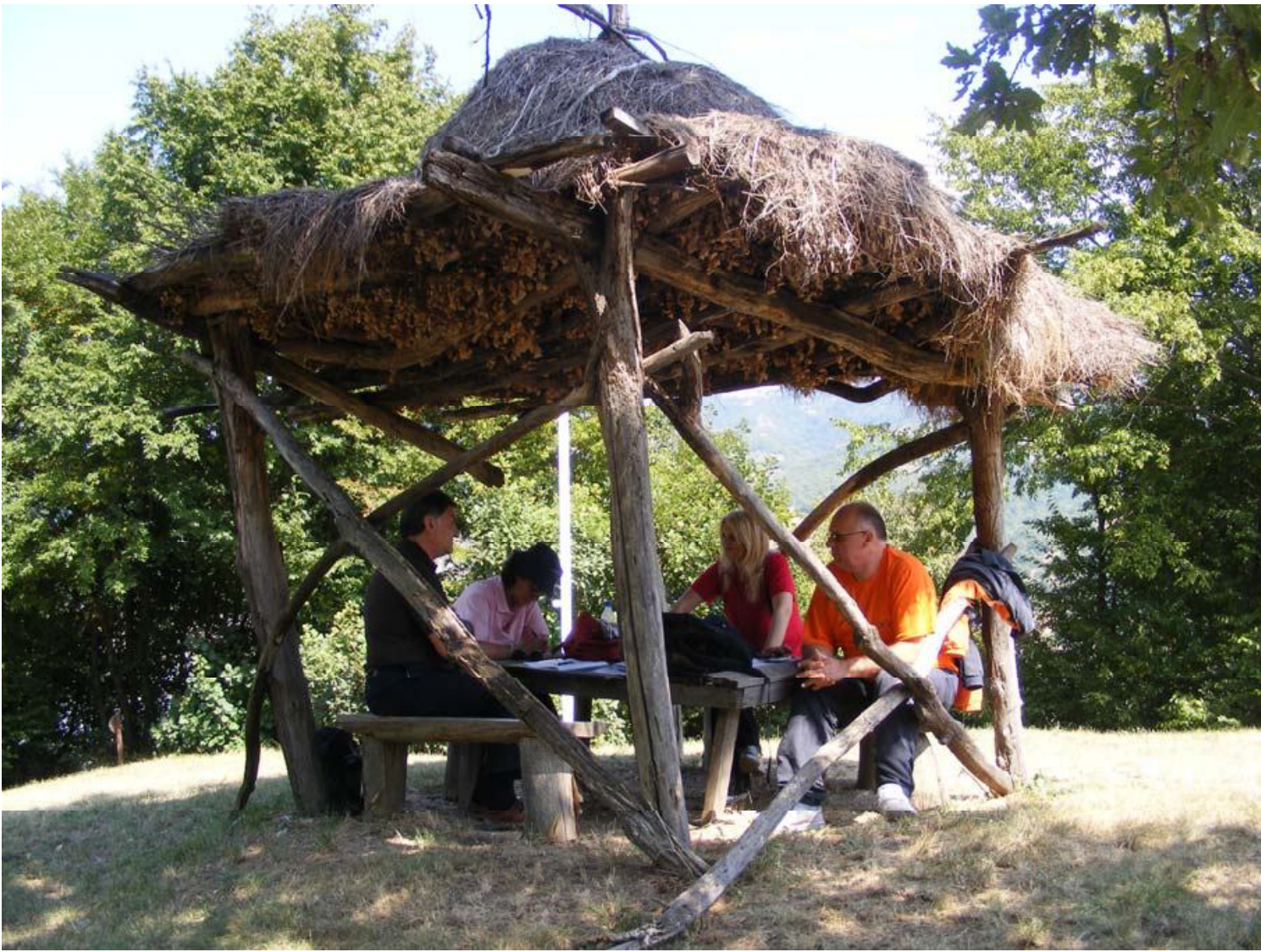
Viewpoint and resting place at the archaeological site Lepenski Vir-Neolithic sites.