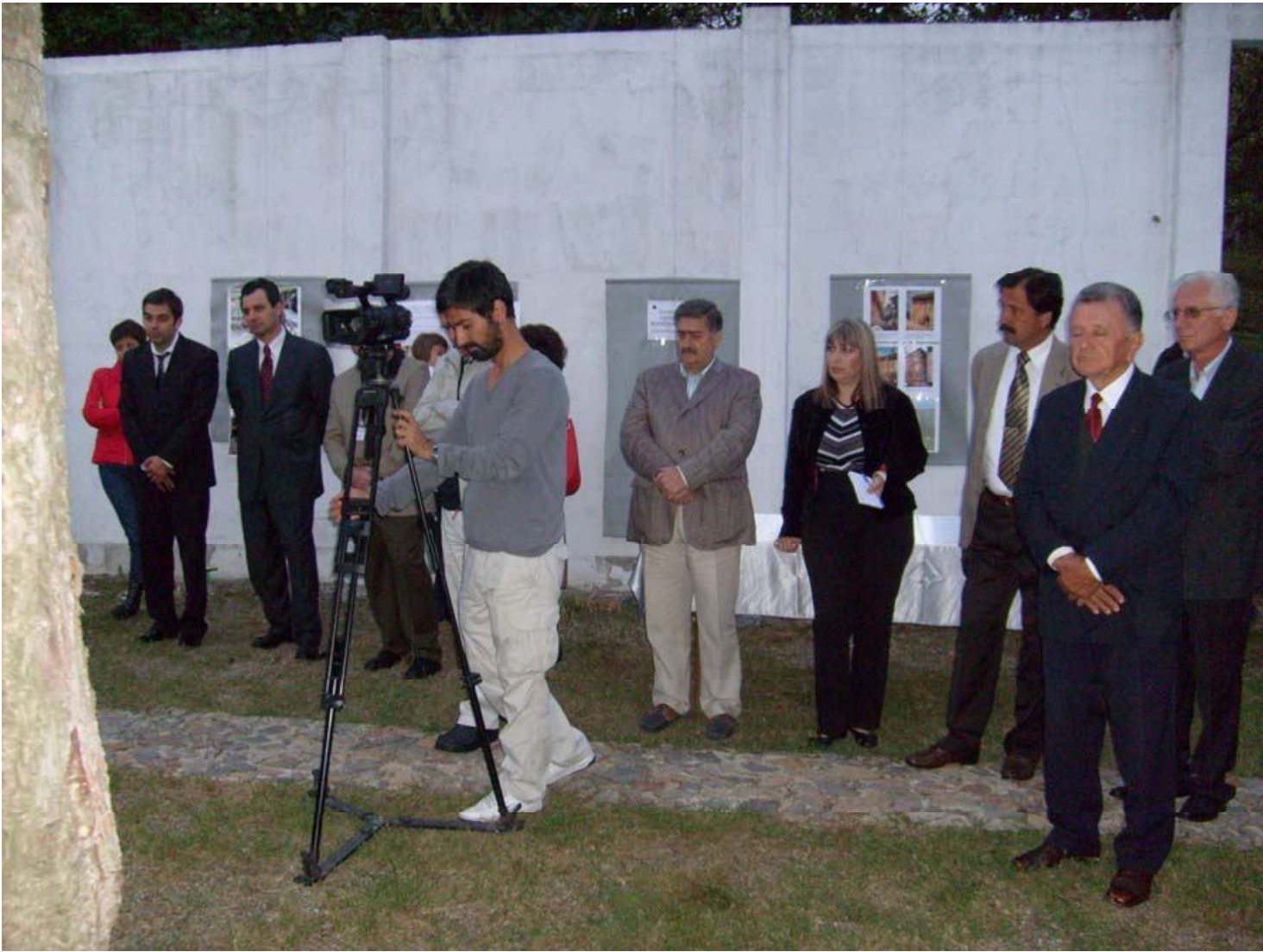
In amphitheater of Innovation Centre DC90, right before the start of the opening of II Innovation colony