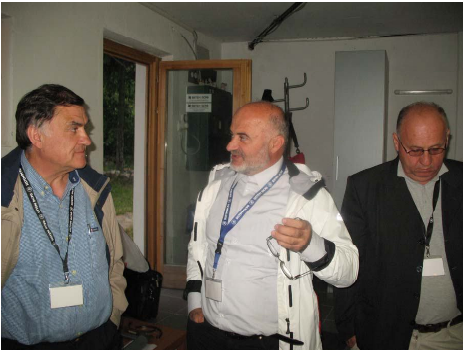
Before beginning the test dampers for control of the moving mass of vibrations from the wind and earthquakes in high office towers and the towers.