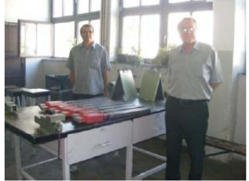
Absorbers in the process of assembling and welding to connecting element