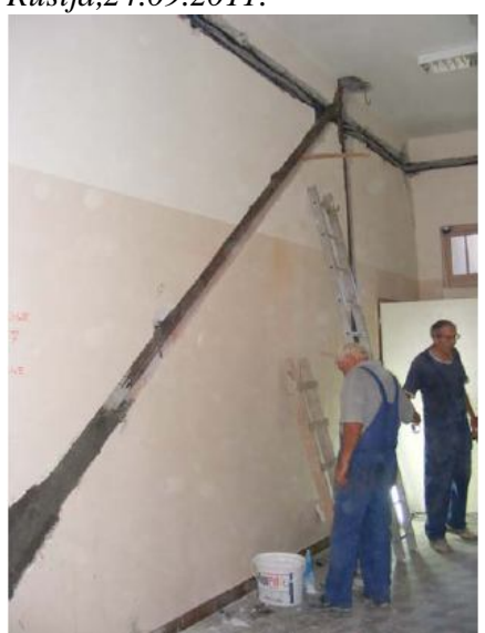
Vertical stiffening of the longitudinal wall in Agrochemical school