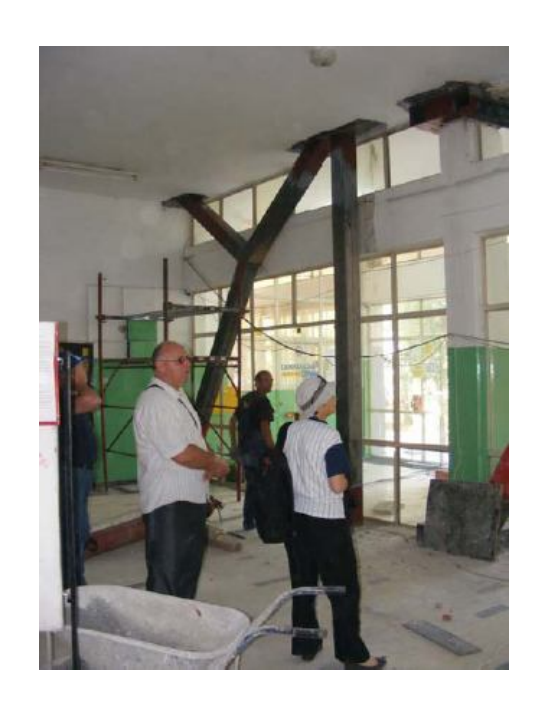
Internal bracing in the Electrotehnical school with dumper in right down corner