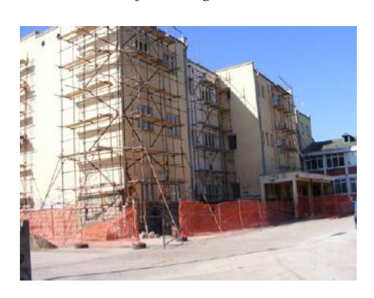
The Facade of the Primary school D. Tucovic