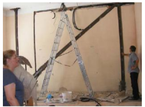
Vertical stiffening of transversal wall in Agro-chemical school