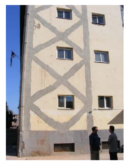
The facade of the Economic school