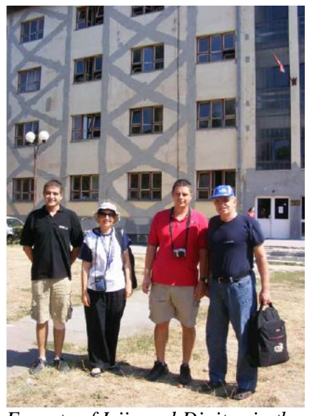
Experts of Iziiz and Digitex in the process of measuring