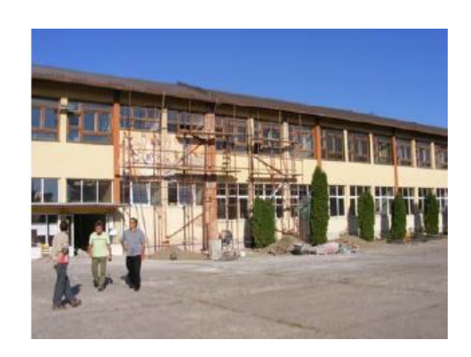
Facade of the Primary school J. Kursula