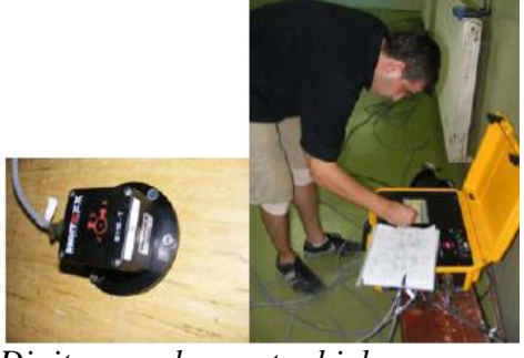
Digitex accelerometer high sensitivity and accuracy of +-0.1% and a system for acquisition and signal conversion