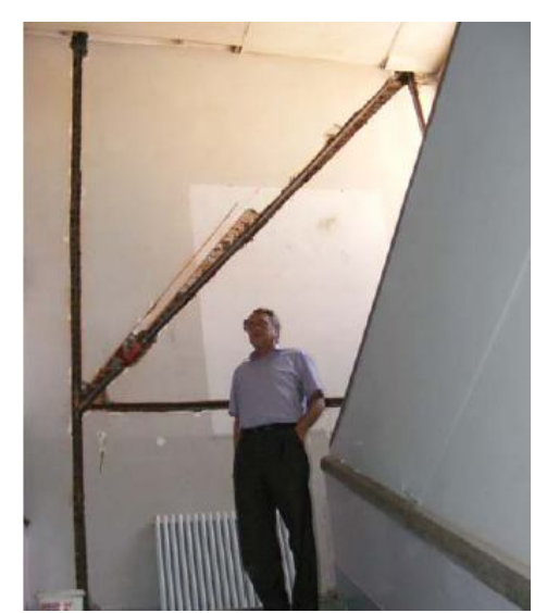
Internal transverzal stiffening of the Mechanical engineering school