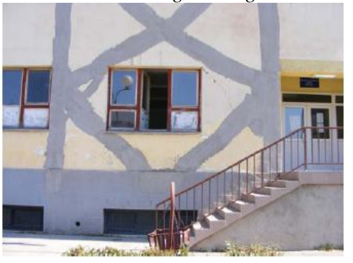
Facade of the High school with a visible diagonal crack in wall