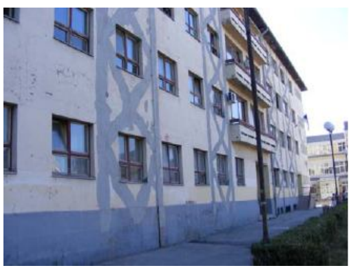
The Facade of the High school