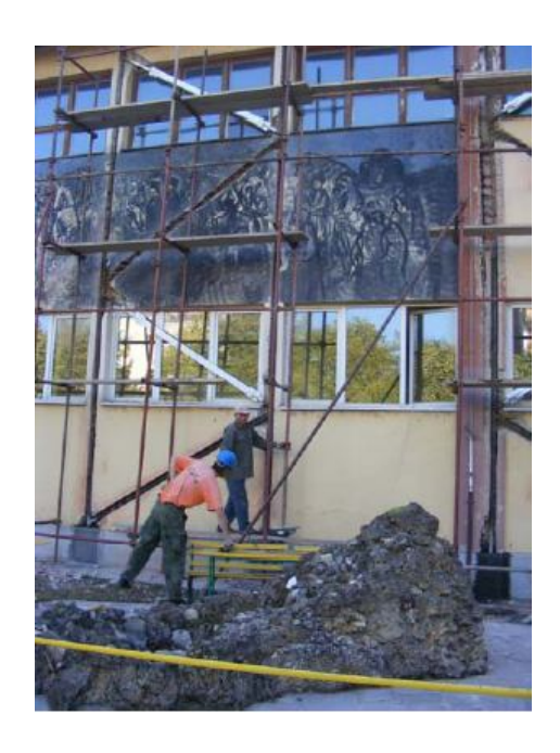
Vertical stiffening of the Primary school J. Kursula